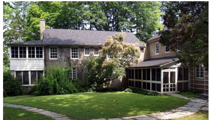
Eleanor's Home – Hyde Park