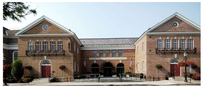
Baseball Hall of Fame - Cooperstown