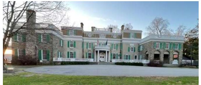
FDR Home – Hyde Park