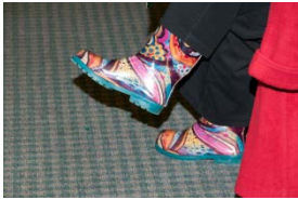
Always the snappy dresser!