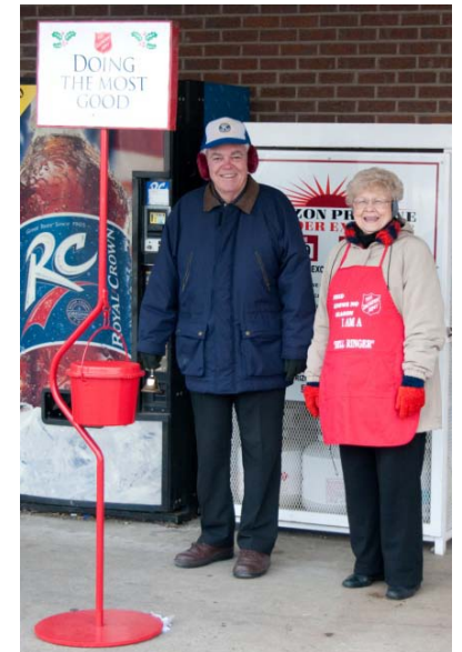
Ringling the Bell for Salvation Army