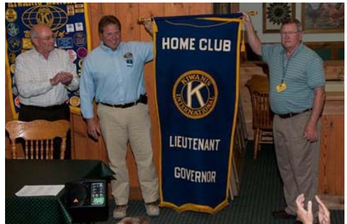
Div 27 Lt Governor Banner comes home to Tuscola