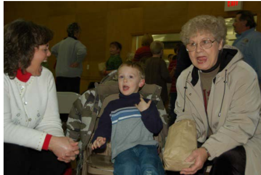
ChristmasTown Movie Night