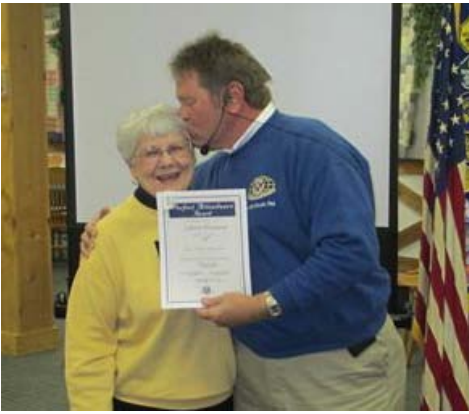
Six Years of Perfect Attendance 10/8/12