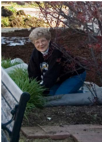
Kiwanis One Day – BETHS Place