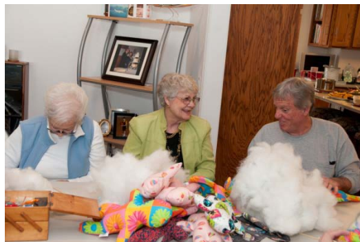
Trauma Doll Workshop