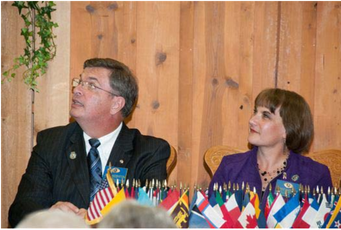
Governor & First Lady