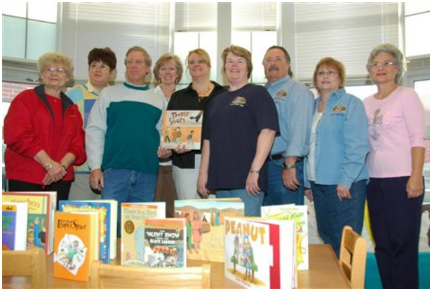
A few of the attendees – not a bad looking group