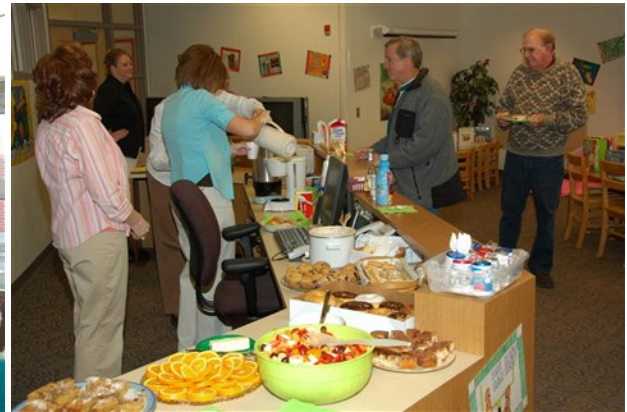
What a breakfast feast!

Abigail Adams, wife of second President John Adams, asked: “If we do not lay out ourselves in the service of mankind, whom should we serve?” There is only the one choice, between care for oneself and altruism. Kiwanians have chosen altruism. We lay out ourselves in the service of mankind, to change the world one child and one community at a time.