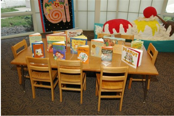
Just a few of the books purchased with the $600.00 donation