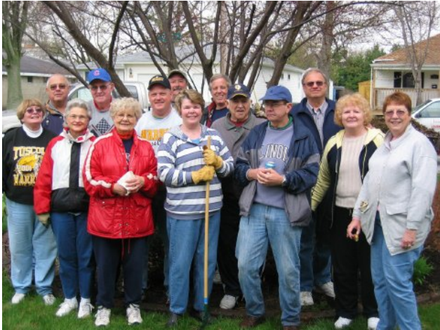
The Crew (plus Wayne behind the camera)