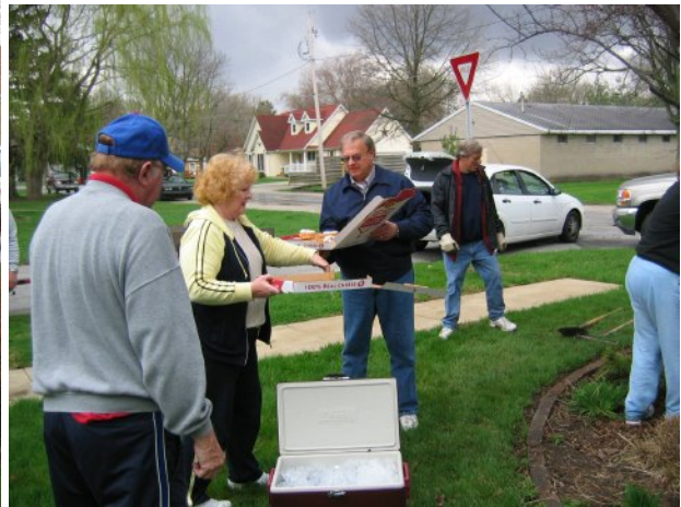
Mmmm...time for a donut break