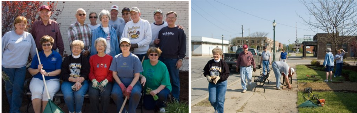
Great job, Kiwanians!!!

Many club members came out to “spruce up” the mini-park at the 100 block of South Main Street on a beautiful Saturday morning, April 28 th . Trenches were dug, weed barriers installed, new rock/mulch put down and bushes/plants trimmed. Be sure and take a look next time you drive by.