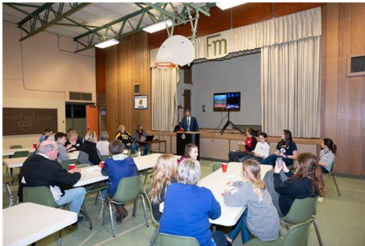
More photos on club website