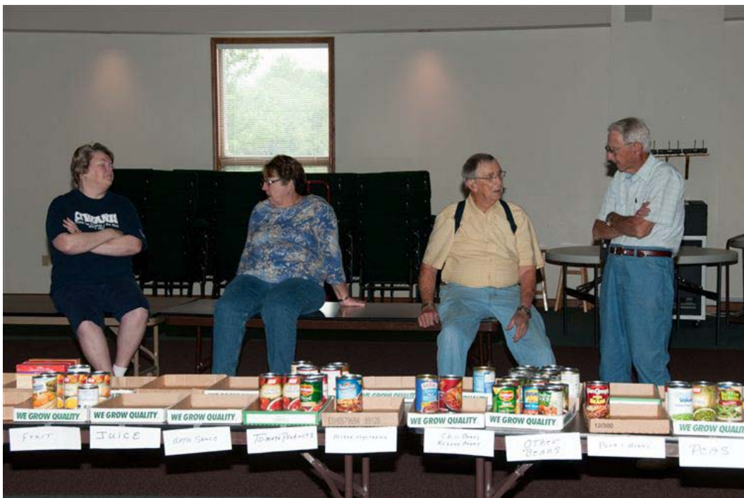
Waiting for more food....