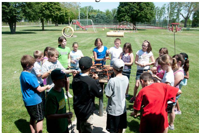
Hot dogs all around