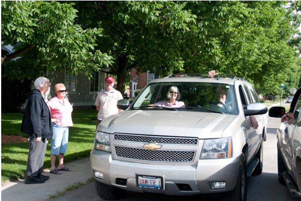
Off they go with a mail carrier....