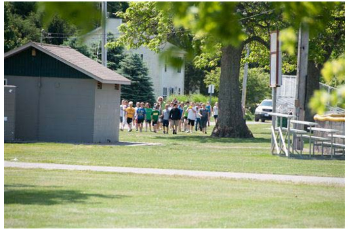
Here they come!