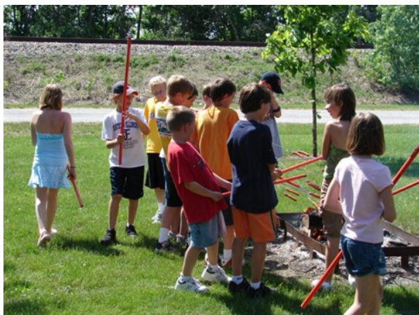
A Good Time Was Had By All!