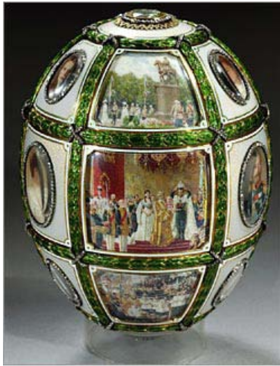
Fifteenth Anniversary Egg