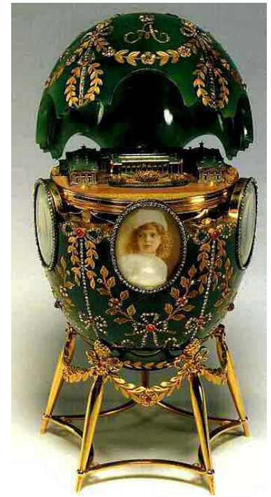
Alexander Palace Egg