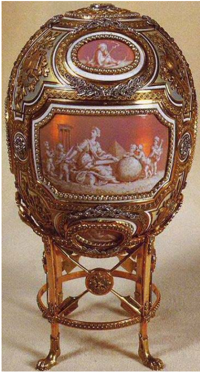
Catherine the Great Egg