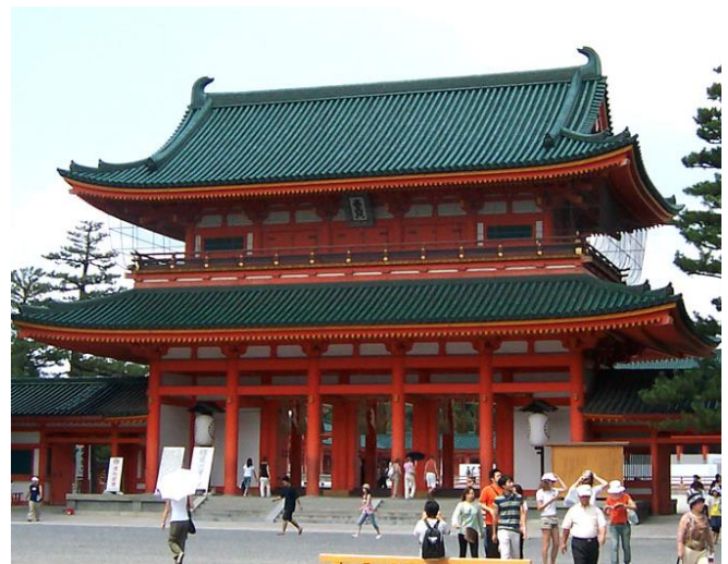
Heian Shrine in Kyoto

The trip began in Chiba, a suburb of Tokyo, for the Kiwanis International Convention. After the convention, they toured for 10 days, using private guides at all the visited cities. They enjoyed a traditional tea making ceremony, Kyoto dinner with geisha entertainment, gold-leaf making in Kanazawa, cormorant fishing northwest of Kyoto, a dinner cruise in Tokyo, as well as seeing many historical shrines and temples.