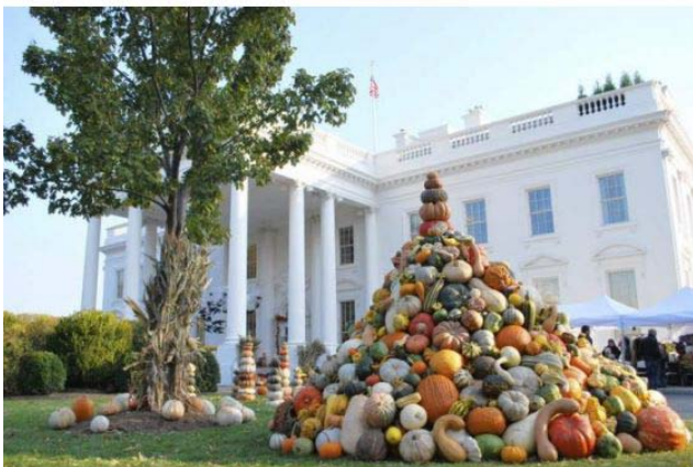
2010 Halloween -North Lawn White House