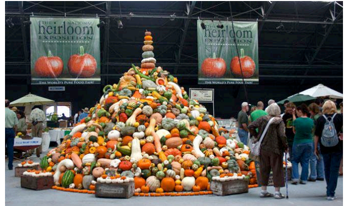
2011 National Heirloom Exposition