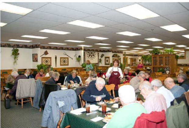
Lots of room for everyone.

Annual Pancake Breakfast – Members were reminded that the pancake breakfast will be Saturday, February 12 th at Forty Martyrs Hall.