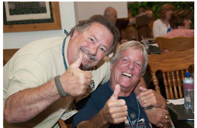
Hoel/Weber Moving Company