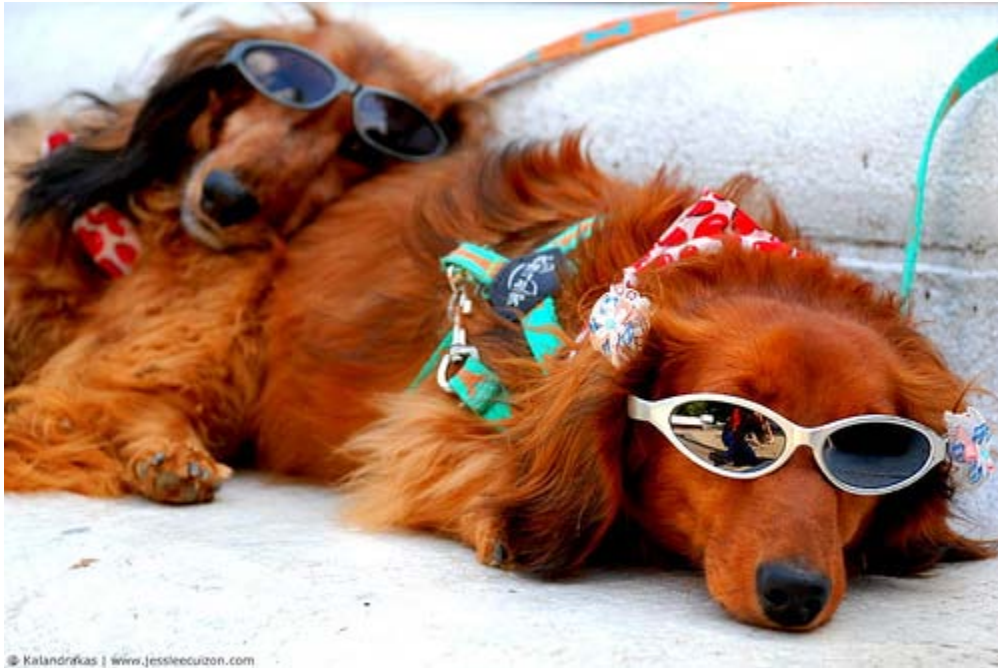
Dog Days of Summer